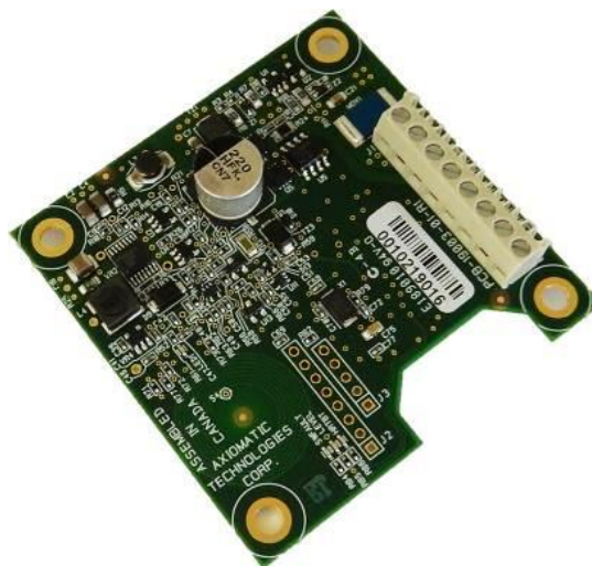
AX020720 - PCB assembly with screw terminals

The controller is available in 3 models; PCB Assembly with screw terminals (P/N: AX020720), PCB installed in a metal box with PG9 strain relief (P/N: AX020720-PG9), or a PCB installed in a metal box with PG9 strain relief and 1.5 m unterminated cable (P/N: AX020720-1.5M). The latter two models have IP67-rated protection when the cable is installed properly.