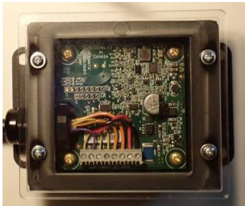
PCB installed in metal box (AX020720-PG9)